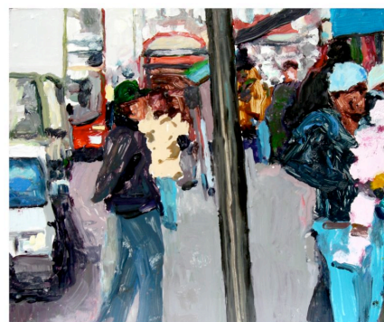
Street Scenes 3, 13. Oil on board. 29.5 x 36cm.