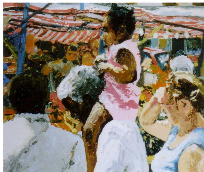
Market Crowd. Oil on board. 62 x 76cm.

In this sense, the paintings bring an intimist sensibility to the depiction of public space.