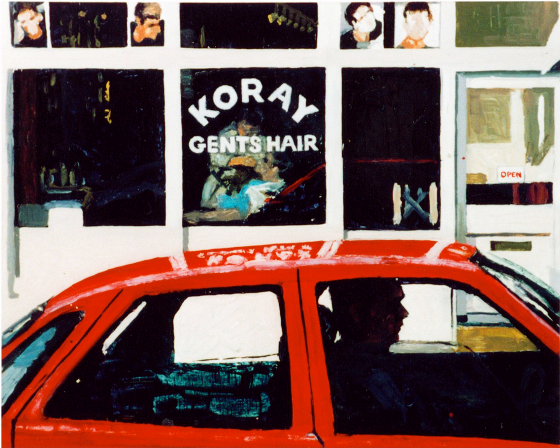
Koray Gents Hair. Oil on board. 100 x 124cm.