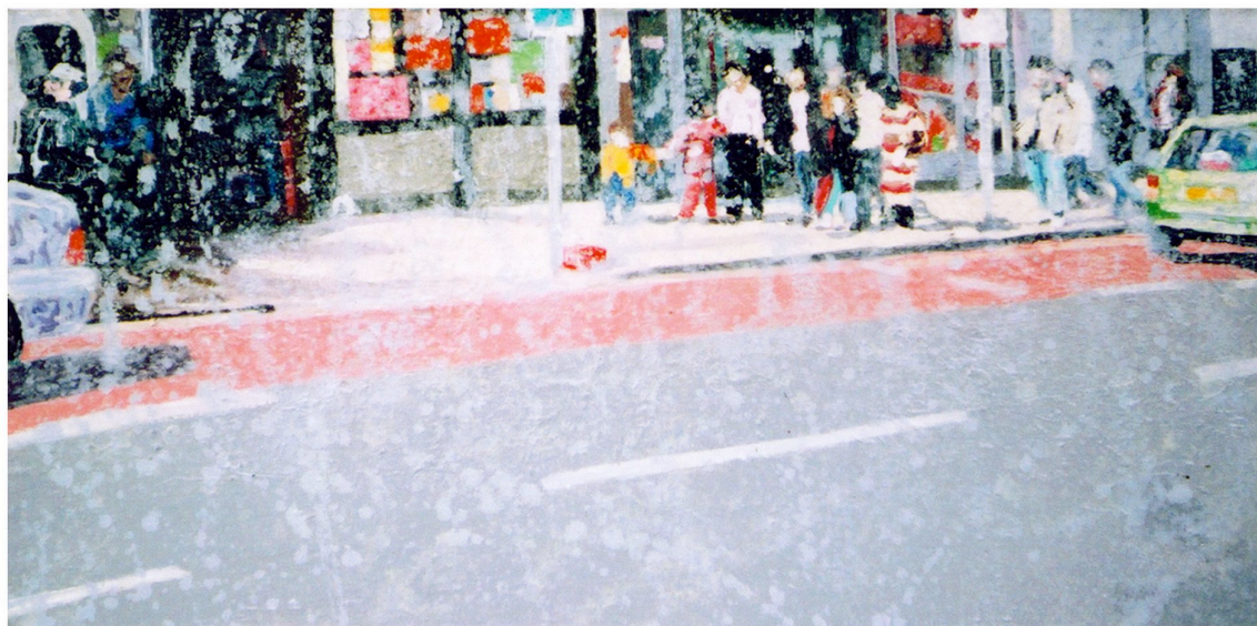
Across the Street. Oil on canvas. 76 x 152 cm.

In many of the pictures I wanted to create a sense that the scene has just been glimpsed in passing . A moment has been caught, and has impressed itself on my mind, yet I have not retained all the detail. It passed quickly. Across the Road creates this effect very strongly – nothing in it is seen clearly. All the activity in the painting is pressed up against the top edge beyond the grey expanse of the empty road, and veiled behind what could be drizzle, haze or dirty glass. There are some figures on the pavement, and perhaps it was they who caught my eye. But only for a moment, in passing.