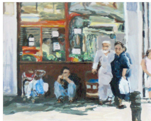
Street Scene 10. Oil on board. 29.5 x 36 cm.

By conceiving painting as a play of visual signs, I can refer to complex layers of meanings. For instance, I like to include signs of what is outside the picture frame, behind you, about to impinge on your awareness, on your physical space – a shadow, a reflected red that tells you of the bus on the other side of the road, lines painted on the tarmac that tell you where the traffic is coming from. I paint clothes in the same way, reductively, as signs of colour, so they function almost as flags competing with street signs, cars and buses for the eye's attention, asserting identity. The paintings display numerous signs of cultural identity and local specificity. There are written signs, and fragments of signs. And there are also marks and peculiarities of the painting that seem to signify something that is less easy to give a meaning to.