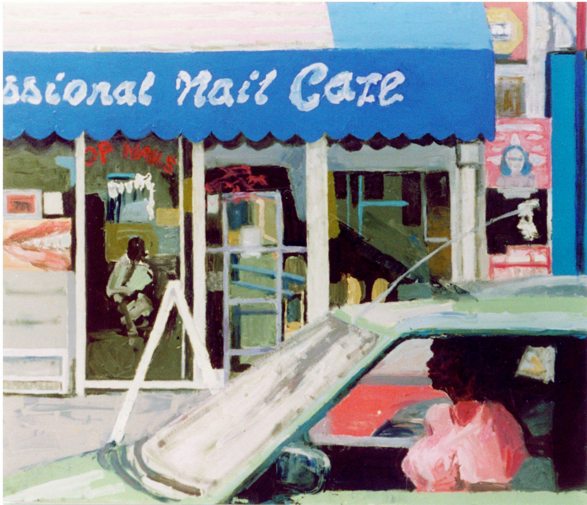
Professional Nail Care. Oil on canvas. 120 x 140 cm.

In the pictures of shop fronts I have been particularly interested in creating complex layers of meaning and ambiguity. The paintings show shop fronts in a way that creates a membrane of signs and reflection. The shop windows objectify desires and reflect them back to us. An internal world of dreams suddenly intrudes into the public space. In these pictures, this membrane of signs and reflections becomes like a projection screen of the mental or dream world of the individuals depicted in front of the shops, with all the contradictions and ambiguities of a dream.