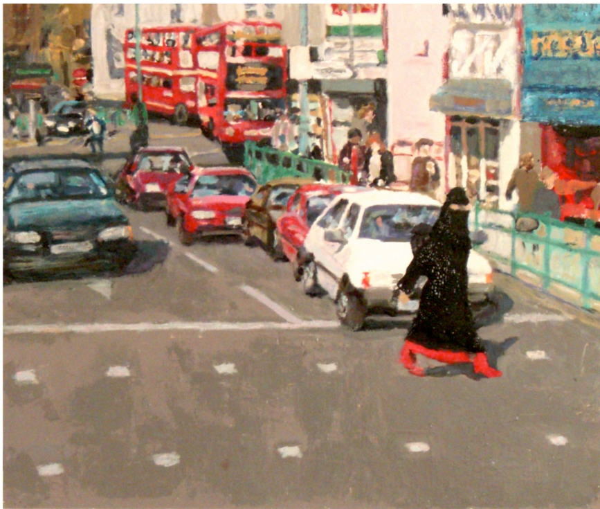
Pedestrian Crossing.. Oil on board. 62 x 76 cm.

Paintings are just appearances. When I look at these paintings, they have an appearance of clarity, which is something I strove to achieve in this series of work. Yet looking at them, they fail to fully describe what I am looking at.