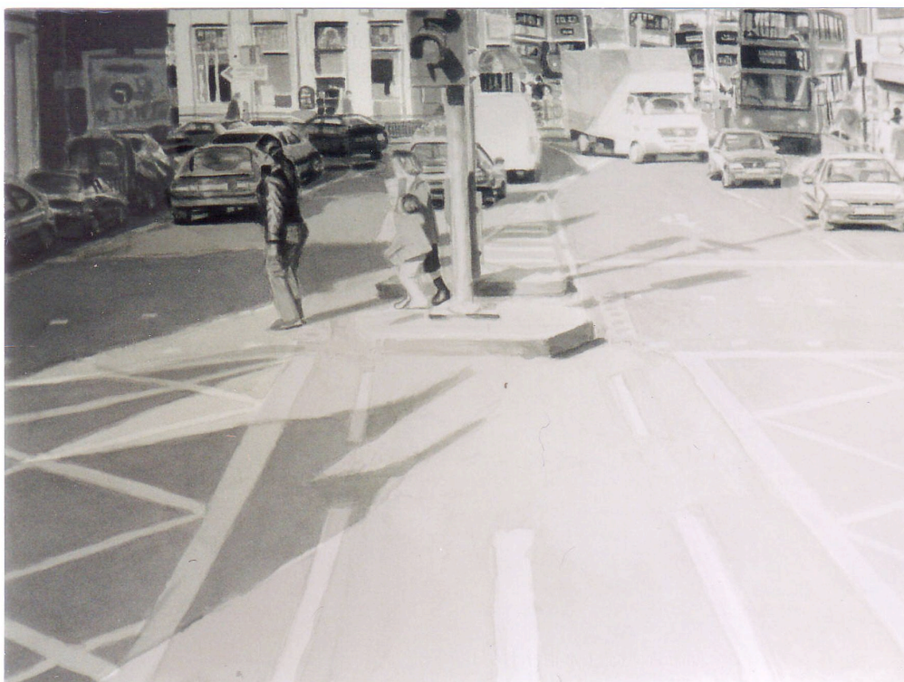
City Series 6. Ink on paper. 56.5 x 76 cm.