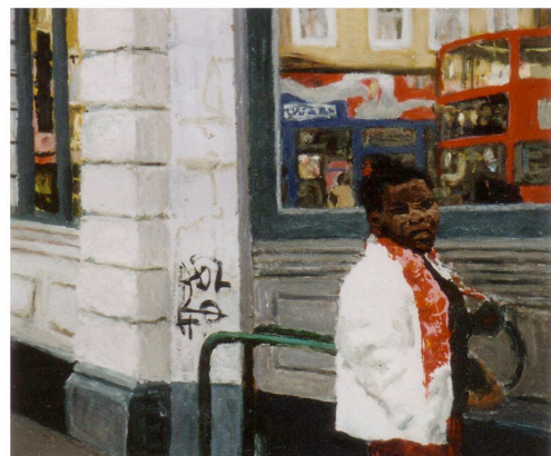
Reflection. Oil on board. 62 x 76cm.

I am interested in moments where the projection of self-identity connects with the intimacy of its origin in the self. This is another sort of glimpse – a glimpse of intimate inner worlds in the public space. In some of the paintings a figure stares out of the picture directly at the viewer, and this forms a potential connection or bond to the inward source of identity – a potential bond whose power is felt in the uneasiness and resistance to meeting the gaze.