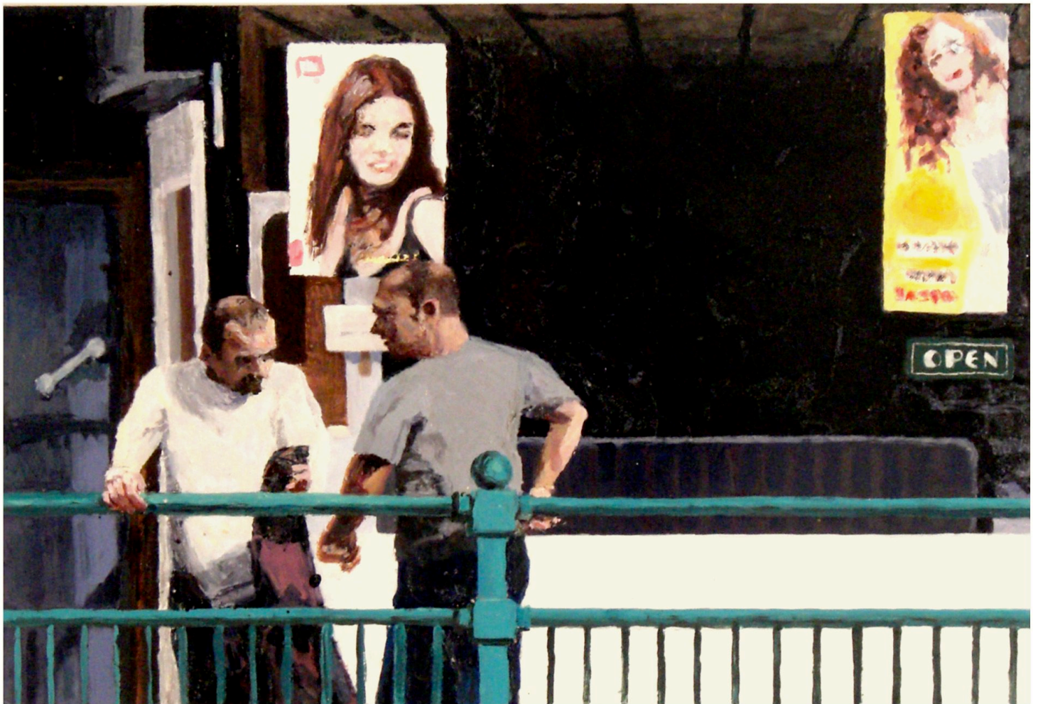
Conversation, Oil on board. 62 x 93cm.

“When I am structuring a painting, what I am doing is structuring relationships. The form of a painting makes sense to me as a structure of human relationships”