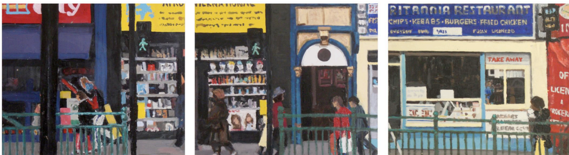
Wigs and Chips. Oil on 3 canvases. 62 x 76cm. (x3)

A series of sharply defined yellow shapes dance across the surface of the Wigs and Chips triptych giving visual structure to the three paintings. I could list what these yellow shapes appear to represent: a shopping bag, the buttons on either side of a pedestrian crossing, a shop sign (cut into three rectangles by the visual intrusion of a post), and the absent space caused by the gap between two of the canvases), a sandwich board, and some window stickers. But in the painting, these ill-defined, disparate things are all united in their function as signs displaying their yellowness that clamours for my visual attention.