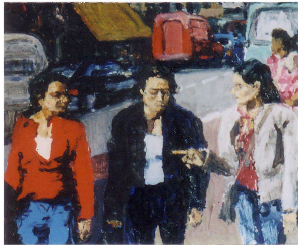
Street Scene 8. Oil on board. 29.5 x 36 cm.

In other pictures there is a conversation going on between people. What interested me in these pictures was the sensation of gossip, of overhearing fragments of speech, of wondering and imagining what the people are talking about. The conversations create an aura of intimacy around the people, a sort of complicity that I cannot share, and that piques my curiosity.