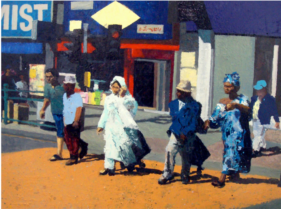
Starting from now. Oil on canvas. 150 x 200 cm.

It is not just the people who are engaged in display and self-projection in the urban space. The street itself, and the buildings that flank it, are a façade for the projection of cultural identity and display. And, on another level, the actual paintings are also a display of both the contradictions and the connecting bonds between disparate projections of identity.