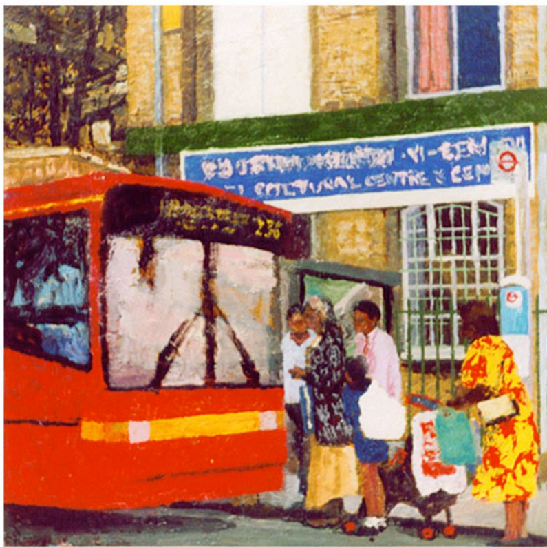
Bus Queue. Oil on canvas. 129 x 129cm.

I set out in these paintings to paint people going about their ordinary lives in the streets. The paintings take as their subject what most people are doing in public space most of the time: walking, looking, shopping, talking, crossing the road, waiting for a bus, sitting in a car... In choosing such images, I aim to recapture a perception of the socially shared space of the street. It is a space in which most of the time, people are getting on with the ordinary business of living.