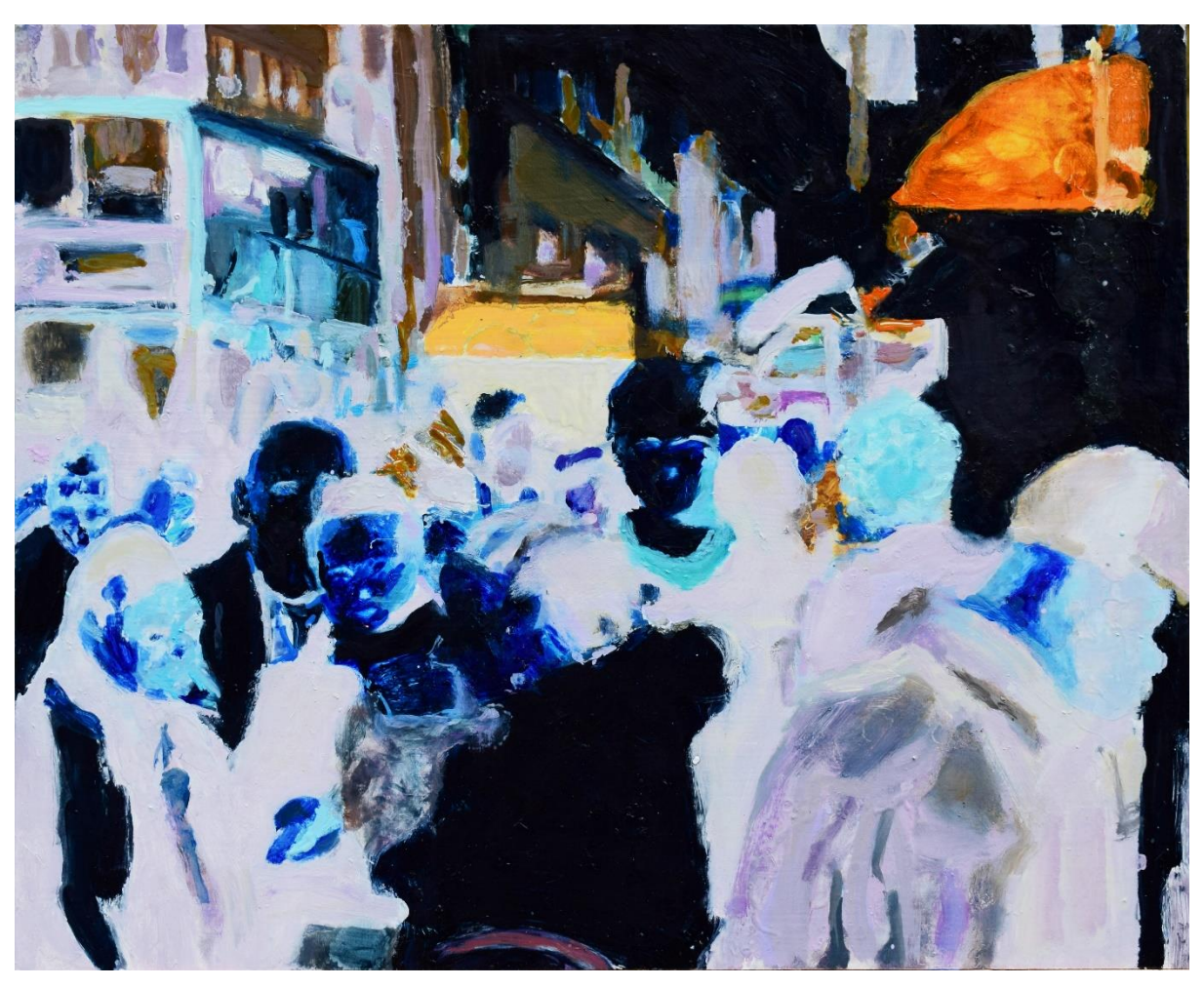
Elegy for Street life #7, oil on aluminium, 40 x 50cm